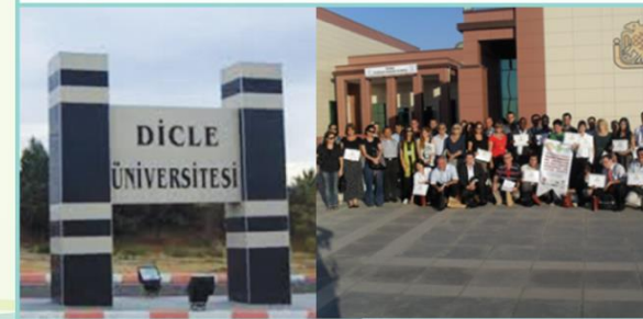
CONGRESS AND EXHIBITON CENTER

oner_cetin@yahoo.com, onercetin@dicle.edu.tr, nuzen@dicle.edu.tr