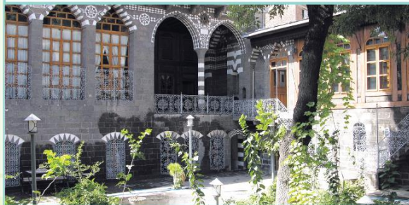
CAHİT SITKI TARANCI MUSEUM

There are flights to Diyarbakir Airport, from Istanbul, Ankara, Izmir, Antalya operated by Turkish Airlines and some private airlines (Pegasus, Onur Air, SunExpress). The participants can use any airlines via one of the city airports stated above.